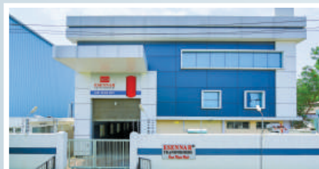
Cast Resin Unit