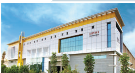
Oil Cooled Transformer unit